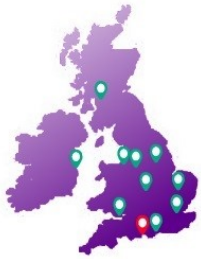
11 UK Locations