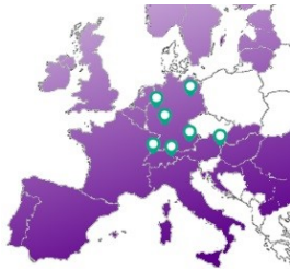
7 European Locations