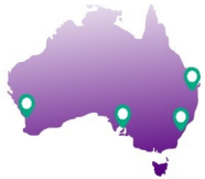
4 Australian Locations