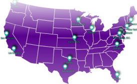
13 US Locations