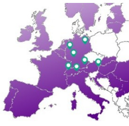
7 European Locations